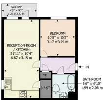
ALCOCK CRESCENT DA1

Reference to tenure, leases, service charge, ground rent, estate management charges, fixtures, fittings, condition, extensions, planning permission, building consents/regulations, building works, conversions, or any other statement contained in these particulars should not be relied upon and must be verified by a legal representative or solicitor before any contract is entered into. If clarification or further information is required, please contact us before making an appointment to view, especially if you are travelling some distance.